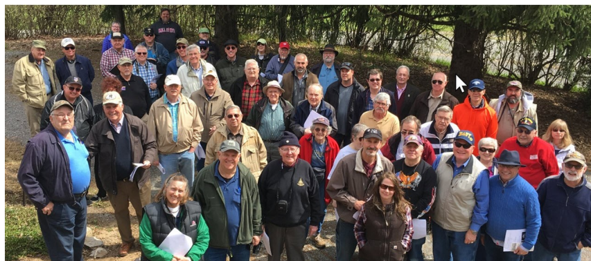
Lee's Retreat Field Trip, 2018—Falling Waters, MD

All this presupposes that the coronavirus pandemic will be under control by this fall, and that everyone who wants to go on the trips will be vaccinated. The current rate of vaccination is very encouraging. In the interests of safety, everyone participating in these field trips should be prepared to provide proof of vaccination against COVID-19.