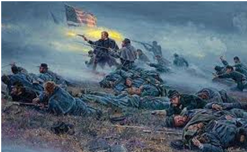
Battle of Fredericksburg, December 13, 1862