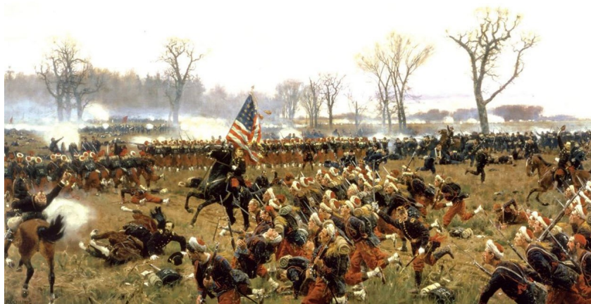
Battle of Fredericksburg, December 13, 1862

As a reminder, everyone participating in our field trips this fall is required to provide proof of vaccination against COVID-19 before boarding the bus.