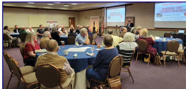
An excellent turnout for the September 16 kickoff of Campaign 64