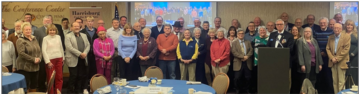
More than 60 members and guests came out for our November engagement!