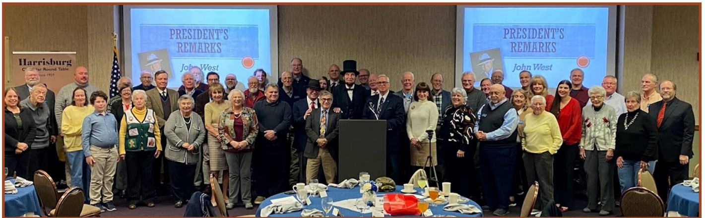
Our December engagement with President Lincoln was a night to remember!