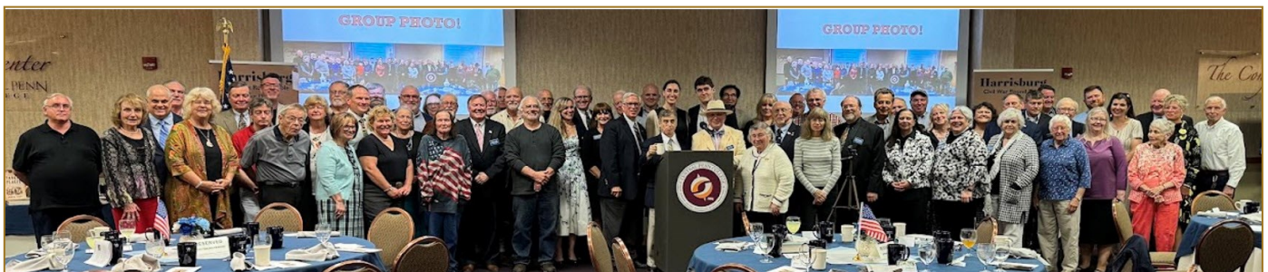
We had a record turnout for our 65th Anniversary celebration in May.