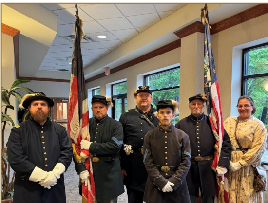
The Bucktails' Color Guard kicked off the banquet.