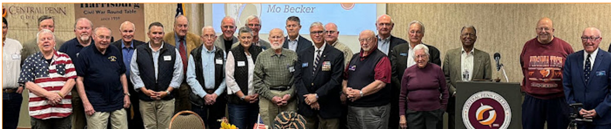
A record number of veterans joined us for dinner in November. Thank you for your service!.